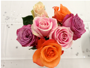
Beautiful centerpieces at the brunch.