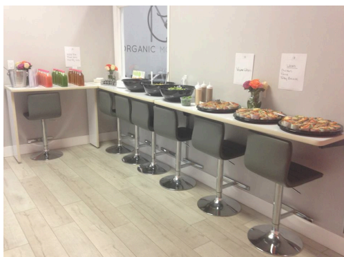
Delicious brunch catered by Juice & Java.

working up a sweat and an appetite, the attendees enjoyed a delicious, healthy brunch at the studio catered by Juice & Java. Thanks to the generous sponsorship of Choice Mediations, LLC, this wonderful event was free to all members!