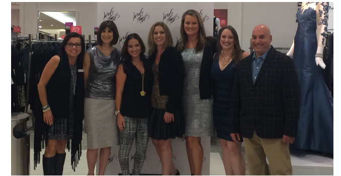
Fashion Show at Lord & Taylor

As you are reading this, you are likely celebrating the holiday season with us at our holiday party at La Cigale in Delray Beach! We hope you are enjoying this festive way to close out 2015 and celebrate our camaraderie and friendship.