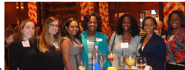
Joint Event with Broward County Women Lawyers Association at the Seminole Casino

October proved to be a busy month as well. A joint event with the Broward County Women Lawyers Association was held at The Seminole Casino in Coconut Creek, where we participated in a CLE program on building business and relationships. In an effort to recognize Breast Cancer Awareness Month, the annual Think Pink Luncheon was once again held at the Boca Grove Golf & Tennis Club. Through the generosity of SPBC FAWL members and guests, a generous contribution was made to the EBC Foundation, focusing on the