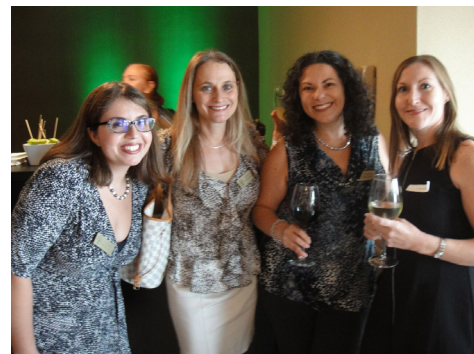
Membership Reception at Farmer's Table

prevention and cure of breast cancer. Rounding out the month of October were our new member luncheon, a cocktail and networking event with the Diversity and Inclusion Committee of the South Palm Beach County Bar Association, and our participation in the new attorney breakfast at the West Palm Beach Courthouse.