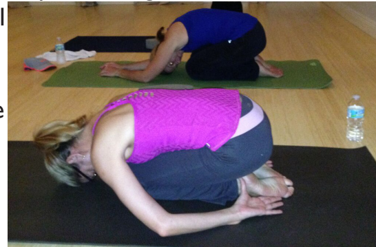
FAWL Fit Series at Yoga Journey