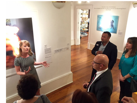
Happy Hour at Cornell Museum of Art

December offerings included a variety of events. We had a networking happy hour at the Cornell Museum of Art in Delray where we enjoyed light bites and cocktails as we viewed beautiful works of art by female artists. At our December membership luncheon, we welcomed guest speaker