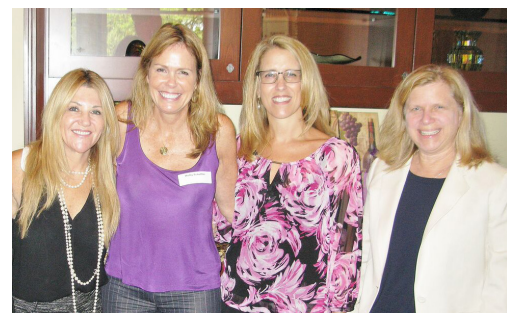
Think Pink Luncheon at Boca Grove Golf & Tennis Club

prevention and cure of breast cancer. Rounding out the month of October were our new member luncheon, a cocktail and networking event with the Diversity and Inclusion Committee of the South Palm Beach County Bar Association, and our participation in the new attorney breakfast at the West Palm Beach Courthouse.