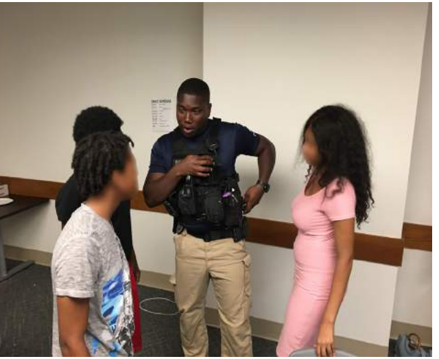
Participants interacting with law enforcement

Ten youth completed the program, four of whom were successfully terminated from Probation. Entities that partnered with the program included: law enforcement, FAU, Department of Juvenile Justice,